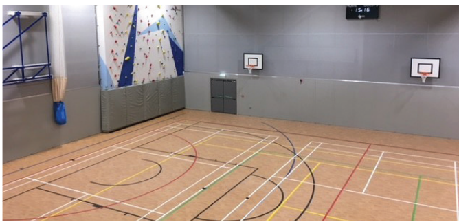
DYNAMIK A4 AREA ELASTIC SPRUNG FLOOR FINISHED IN SPORTS VINYL AS INSTALLED AT BADMINTON SCHOOL

There are considerations that sometimes are not made clear to the end user. For example, current requirements from the Education & Skills Funding Agency (ESFA) state that activity spaces, such as those used for sport, must now be sprung A3 or A4 area elastic floors. A foam-backed vinyl is a point elastic floor (P1, P2 or P3) and as such would not meet the current ESFA specification or guidance.