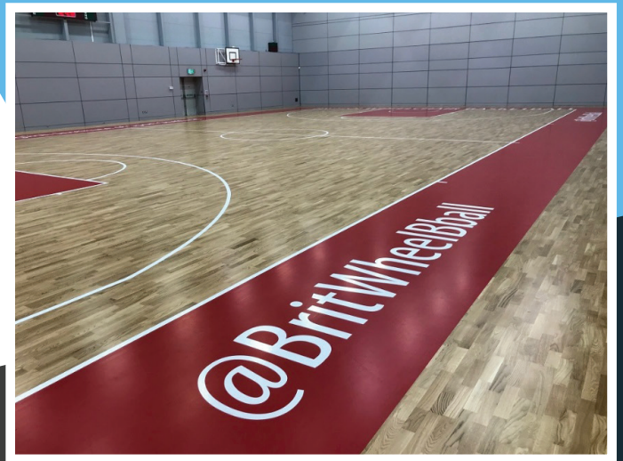
DYNAMIK SPRUNG OAK FLOOR AT BWB TRAINING VENUE

Sprung wooden floors provide wheelchair users with ideal rolling resistance, not allowing chair castors to sink into a soft foam backing. Spongy foam backed surfaces may contribute to stress injuries and fatigue, affecting all levels of wheelchair usage, therefore a surface with a low rolling resistance is the official requirement of BWB when choosing a venue or supporting a project where questions of suitability of surfaces require guidance or support.